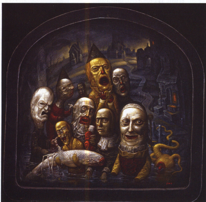
Chris Mars, "A cleansing at Blue Bay," 2004, oil on board.

Japanese "mass surrealism" (Manga) burst forth internationally as a global phenomenon in the contemporary art market initiated by a new generation of artists who were absorbed by Pop subcultures. Much the same way as Andy Warhol and Roy Lichtenstein were influenced by comics and advertising, many contemporary surrealist artists are incorporating images from a new and international phenomenon of pop culture,